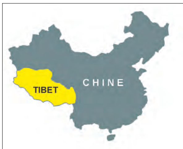
Fig. 1: carte de situation

Therefore, giving interest to alternative foods appear justified (MALAISSE 2001) and made the aim of an ethno-ecological survey conducted from 2000 to 2005 during Summers, and in Autumn 2007, successively in the frame of the Kashin Beck Disease Project (HAUBRUGE et al. 2000) of "Médecins Sans Frontières-Belgium" (MSF-B), and later in the frame of the Kashin-Beck Disease Foundation.